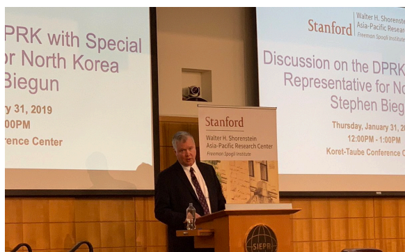
Figure 1 US Special Representative for North Korea Biegun remarks on DPRK at Stanford.

The US and the two Koreas leaned toward the Feb. 27–28 Trump–Kim summit with much fanfare, though Washington and Seoul sought to temper expectations in the immediate run-up to the event, reflective of stumbling blocks that played out. US Special Representative for North Korea Policy Stephen Biegun had laid out the US approach for an agreement that would bring significant economic and other benefits in exchange for denuclearization during his Stanford University address in late January, and South Korean Foreign Minister Kang Kyung-wha had urged real progress in the next round.