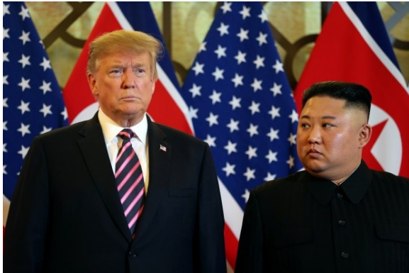
Figure 2 Trump and Kim pose prior to their meeting in Hanoi on Feb. 27.

Council. Also elevated to that body was Vice Minister Choe Son Hui, who joined Foreign Minister Ri Yong Ho in an impromptu press conference in Hanoi, signaling that the diplomats may carry the North forward on its next steps. The condemnation by the North of Pompeo and Bolton should also be seen in that light: we've removed our principal interlocutor, you should do the same. That and the show of force with short-range missile tests in late April might also be seen as Kim playing to hardliners after perceived Hanoi failures.