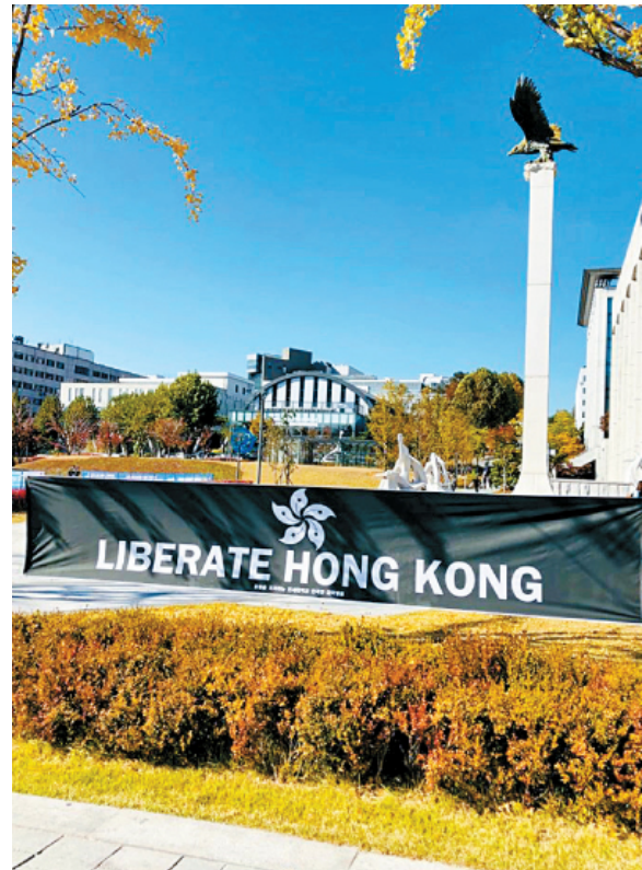
Figure 4 "Liberate Hong Kong banners" hung at Yonsei University, where two Chinese students were caught attempting to take down the banners.

Xi and Wang's latest visits to Seoul did not offer South Koreans much reassurance on future cultural interactions with Chinese counterparts. Current concerns have shifted to clashes between pro-Hong Kong demonstrators and mainland Chinese students on university campuses in Korea. Student clashes required the foreign ministries to step in as protests spread across major universities from November. The ROK Foreign Ministry expressed concerns over Hong Kong's escalating situation and raised its travel warning that same month. After two Chinese students were caught taking down "liberate Hong Kong" banners at Yonsei University on Nov. 12, the PRC Foreign Ministry insisted such actions were " reasonable " while also calling for compliance with local laws. According to the PRC Embassy in Seoul, the students were "expressing their opposition to words and actions that harm Chinese sovereignty." As Hong Kong protests quickly spread to other campuses, Chinese students accused their Korean counterparts of interfering in China's affairs. Even on social media, K-pop star Choi Si-won apologized to Chinese fans after "liking" a Hong Kong news post prompted a Chinese fan club to threaten to close down.