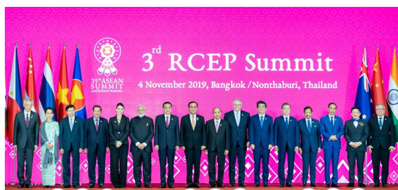
Figure 3 Li attends the 3 rd Regional Comprehensive Economic Partnership Summit in Bangkok.

Chinese multilateral engagements in Asia further showcased Beijing's active diplomacy toward neighbors. In a Global Times interview in September, Moon Chung-in, President Moon Jae-in's special advisor for foreign affairs and national security, identified China as an important mediator between Seoul and Tokyo. The three neighbors joined ASEAN, Australia, and New Zealand for the 3 rd RCEP summit in Bangkok on Nov. 4, which produced what Li Keqiang called a " breakthrough " in advancing the trade deal, despite India's decision to opt out. To be formally signed at the 2020 summit, the "China-led RCEP," according to the South Korean media, remains widely perceived as a threat to Donald Trump's Indo-Pacific strategy. PRC Commerce Minister Zhong Shan, South Korea's Trade, Industry and Energy Minister Sung Yun-mo, and Japan's Economy and Trade Minister Kajiya Hiroshi pledged their support for both the trilateral FTA and RCEP during the 12 th round of trade talks in Beijing on Dec. 22. Despite the consolidation of the China-ROK economic partnership, Chinese analysts cautioned that Washington's Indo-Pacific strategy may still lure Seoul into regional security networks designed to counter China's rising influence.