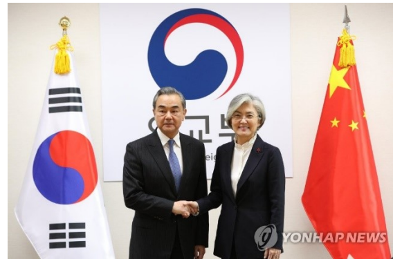
Figure 2 Foreign Ministers Wang and Kang meet in Seoul.

disappointment. Wang met his ROK counterpart Kang Kyung-wha for the second time after meeting on the sidelines of the UN General Assembly in New York on Sept. 25. He also met Moon, leader of the ruling Democratic Party and former Prime Minister Lee Hae-chan, and former UN Secretary-General Ban Ki-moon. In addition to reaffirming their commitment to denuclearization and peace, Wang and ROK counterparts agreed to coordinate Xi's Belt and Road Initiative and Seoul's development strategies, and advance trade via the China–ROK FTA, the Regional Comprehensive Economic Partnership (RCEP), and proposed trilateral FTA with Japan. For Lu Chao of Liaoning Academy of Social Sciences, Wang's visit signaled a mutual willingness to restore ties amid strain in Beijing and Seoul's respective relations with Washington and Tokyo.