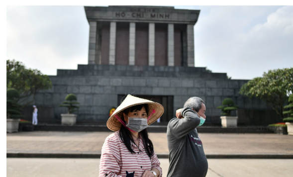
Figure 2 Tourist arrivals in Vietnam fell by double-digits relative to February last year.

There is a widespread belief that the pandemic will permanently change the way business is conducted. With nearly 100 governments closing national borders, flows of people, for business and pleasure, have been stopped. Tourism is an immediate casualty of this decision and many small and emerging economies that rely on foreign visitors are being badly hurt. The UN Department of Social and Economic Affairs (DESA) noted that 11 of the 25 countries in which tourism contributes the most to the economy are in the Asia Pacific region; tourist arrivals in Sri Lanka and Vietnam fell by double-digits relative to February last year. It also noted that small- and medium-sized enterprises account for 80% of the global tourism sector which employs approximately 123 million people worldwide, and they will sustain outsize damage.