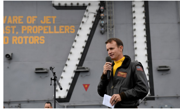
Figure 4 Capt. Brett E. Crozier of the USS Theodore Roosevelt addresses the crew of the aircraft carrier in 2019.

While the number of SDF personnel affected by the virus is unclear, US forces stationed in and around Japan have been affected. US Forces Japan reported its first infection on March 26, but by late April cases appeared to be dropping, with fewer than 30 cases at Yokosuka Naval Base and 6 cases at Camp Zama. US Forces in neighboring South Korea also reported relatively few cases, with 14 personnel infected as of April 1. In a highly-publicized incident, the commander of the USS Theodore Roosevelt ordered to quarantine his ship offshore Guam, appealed for more help when more than 100 of the over 4,000 sailors on the ship were infected. Then Acting Secretary of the Navy Thomas Modly fired the captain, who later turned out to test positive himself for COVID-19, and traveled to Guam on April 6 to tell the crew that if Crozier thought his letter wouldn't become public, then he was either "too naïve or too stupid to be a commander of a ship like this." Modly resigned the next day amid criticism of his remarks, and the US Navy has recommended reinstatement of Capt. Crozier.