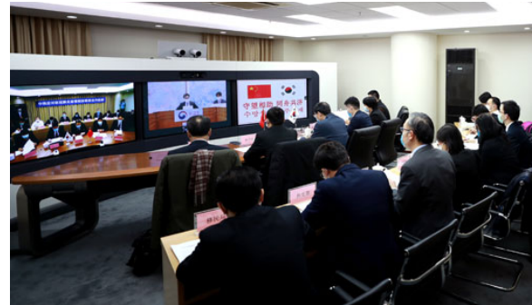
Figure 2 Chinese and ROK officials participate in a video conference as part of their established joint response.

telephone talks on February 20, when South Korea reported its first coronavirus-related death. The foreign ministries led the first working-level video conference on joint contingency measures on March 13, launching a new cooperation mechanism on COVID-19 including health, education, customs, immigration, and civil aviation agencies.