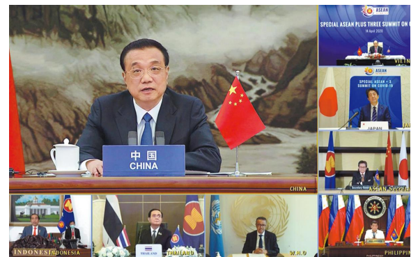
Figure 3 Premier Li speaks in Beijing with ASEAN Plus Three leaders via video conference in April.

The regional spread of the coronavirus reinforced Beijing and Seoul's cooperation with Japan and other partners since RCEP talks in Bali on February 3–4. Foreign Ministers Wang Yi, Kang Kyung-wha, and Toshimitsu Motegi held a trilateral video conference on coronavirus cooperation on March 20, three days after director-general level talks. According to CASS scholars, the meeting highlighted the need to maintain cross-border economic exchanges, high-level political consensus, favorable public opinion, and multilateral coordination. In an interview with People's Daily earlier that month, Deputy Secretary-General of the Trilateral Cooperation Secretariat Cao Jing claimed that such efforts would "inject new impetus to deepening their cooperation," identifying public health, scientific innovation, and the trilateral FTA as priorities. Premier Li, President Moon, and Japanese Prime Minister Abe Shinzo joined a special ASEAN+3 video summit on April 14 affirming their commitment to a collective regional response. The joint statement on COVID-19 identified various proposals including the creation of a regional reserve of medical supplies and an emergency response fund.