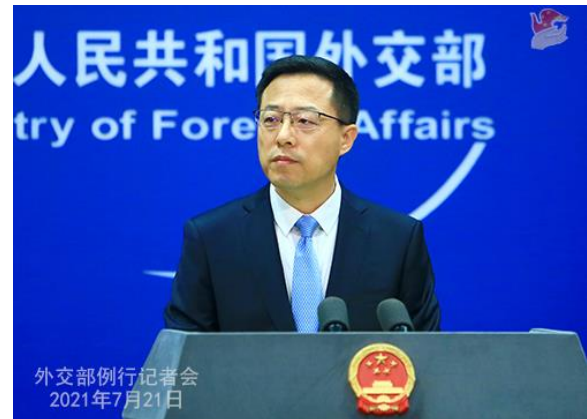
Figure 2 Foreign Ministry Spokesperson Zhao Lijian’s regular press conference on July 21, 2021.

Two weeks later, China retaliated, declaring that the head of the United States Commission on International Religious Freedom, Johnnie Moore, and his family, would henceforth not be permitted to enter the Chinese mainland, Hong Kong, or Macao. Ministry of Foreign Affairs spokesman Zhao Lijian said China’s action was justified because “the United States openly endorsed cult organizations and imposed unilateral sanctions against Chinese personnel based on lies and false information.”