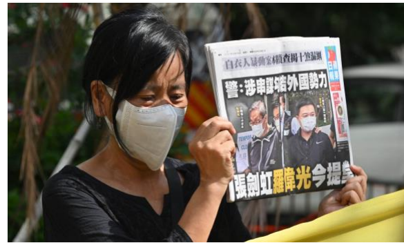
Figure 3 A supporter of two arrested executives of Hong Kong's pro-democracy Apple Daily newspaper holds up a copy of the paper during a protest outside a court in Hong Kong, June 19, 2021.

When Hong Kong's pro-democracy newspaper Apple Daily shut down in late June due to growing Chinese pressure, President Biden issued a strong statement calling on Beijing to stop targeting the independent media and release journalists and media executives who have been detained. "The United States will not waver in our support of people in Hong Kong and all those who stand up for the basic freedoms all people deserve," he added.