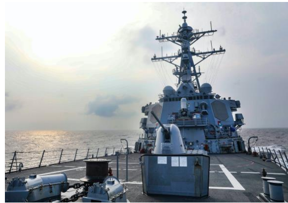
Figure 4 The Arleigh Burke-class guided-missile destroyer USS Benfold (DDG 65) transits the Taiwan Strait while conducting routine underway operations.

US Navy warships sailed through the Taiwan Strait on June 22, July 28, and Aug. 27, bringing the total US transits this year to eight so far. In the August transit, the US guided-missile destroyer USS Kidd was accompanied by Coast Guard National Security Cutter USCG Munro . The 7 th Fleet announced the transits, stating that the operation "demonstrates the US commitment to a free and open Indo-Pacific."