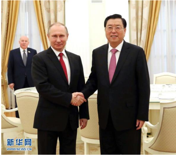
Putin and Zhang Gaoli. Photo by Xinhua, 12 April 2017.

Five days after Zhang Gaoli’s Moscow visit, China’s top legislative leader Zhang Dejiang was in town (April 18-20) for the third meeting of the Sino-Russian Parliamentary Cooperation Committee. Putin also met the second Zhang.