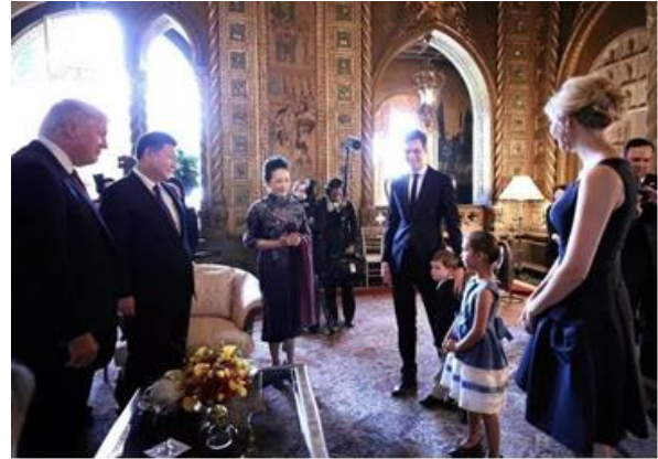
9 April 2017.