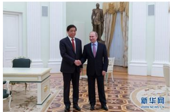
Putin and Li Zhanshu. Photo by Xinhua, 27 April 2017.

In his meeting with Putin, Li also pointed out the unprecedented nature of the relationship between his office (General Office of the Central Committee of the Communist Party of China) and the Russian Presidential Executive Office. Li stressed that the two countries should continue to support each other’s core interests and vital issues of mutual concerns. “No matter how the international situation changes, the two sides will never change their policies of consolidating and deepening their comprehensive strategic partnership; never change their goals of joint development and national rejuvenation; and never change their determination to safeguard international equality, justice, and stability,” Li was quoted as saying.