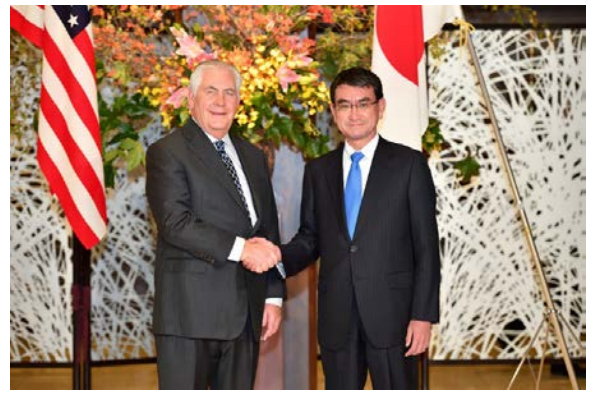
1 Secretary Tillerson meets with Foreign Minister Kono.

Equally important were the sideline meetings. Foreign Minister Kono held a trilateral meeting with Secretary of State Rex Tillerson and Indian Minister for External Affairs Sushma Swaraj, demonstrating Japan's enthusiasm for Indo-Pacific cooperation. Prime Minister Abe met President Trump privately, and then participated in a trilateral meeting with Trump and President Moon Jae-in of South Korea to reiterate their common approach to strengthening defense and deterrence against a more belligerent North Korea.