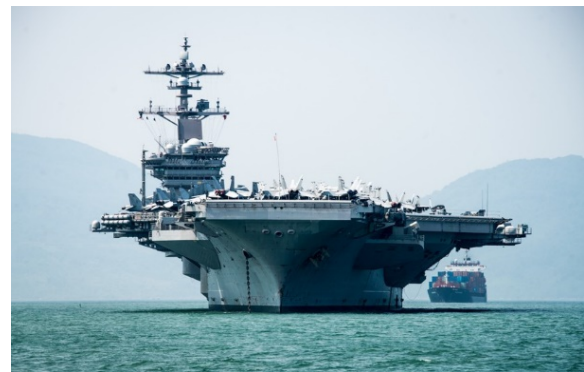
2Aircraft carrier USS Carl Vinson arrives in Danang, Vietnam for a scheduled port visit March 5, 2018

Secretary Mattis' visit to Vietnam, his first to the country, coincided with the 50th anniversary of the Tet Offensive. Assuming this irony was intentional, it served as a backdrop for the progress made since then in US-Vietnam relations broadly, and bilateral security ties in particular. In Hanoi, Mattis met Vietnam's President Tran Dai Quang; Communist Party Secretary General Nguyen Phu Trong; and Defense Minister Ngo Xuan Lich. He pronounced Vietnam and the United States to be “like-minded countries,” and gave as examples of common norms respect for freedom of navigation, for international law, and for national sovereignty. Mattis also thanked the Vietnamese leaders for adhering to sanctions on North Korea, implicitly acknowledging that doing so had come at some economic cost to Vietnam.