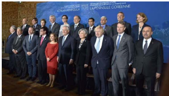
1 Foreign Ministers from 20 countries at a meeting in Vancouver, Canada on January 16, 2018

Whereas the defense requirements to counter Kim Jong-un's increasingly sophisticated missile arsenal focused US-Japan attention at the end of 2017, this year began with a crescendo of diplomacy. In Canada, Foreign Minister Kono Taro and Secretary of State Rex Tillerson joined representatives from 18 other countries to discuss how to manage the North Korean challenge to regional stability. Kono and Tillerson met on the sidelines , and then again with South Korea's Foreign Minister Kang Kyung-wha.