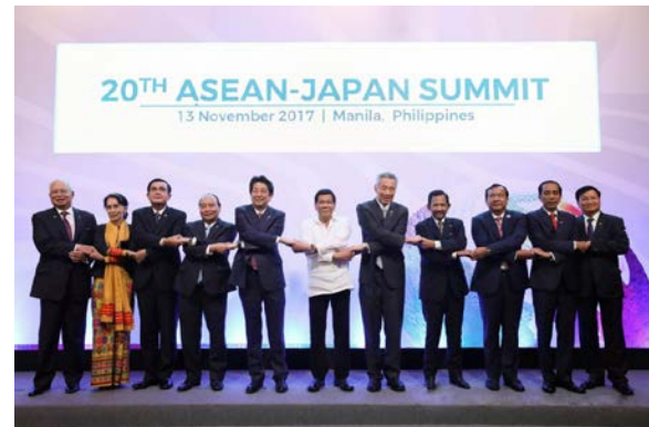
20th ASEAN-Japan Summit 2017 (ASEAN)

Second, ASEAN centrality and unity would become a political issue in the FOIPS. ASEAN's role in FOIPS is not clear. Japan has repeatedly reaffirmed its support for ASEAN centrality and unity – Japan and ASEAN stated that FOIPS “reinforces the ASEAN-centered regional architecture” in the 2017 Chairman's statement of the ASEAN-Japan Summit. In March 2018, Kentaro Sonoura, special advisor to Prime Minister Abe, ensured that ASEAN unity and centrality would not be threatened by the FOIPS. The Japanese argument has been that strategy is evolutionary, but it has failed to explain what roles ASEAN could play in its development and has yet to indicate how ASEAN centrality and unity would be ensured. The evolutionary process to formulate the FOIPS gives greater flexibility to adjust to the prevailing strategic situation in the Indo-Pacific region, yet unless clarified, it would be difficult for ASEAN as an institution to fully support the strategy.