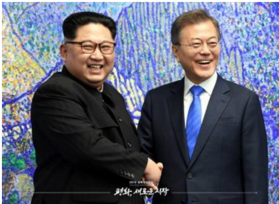
2.South Korean President Moon shakes hands with North Korean Leader Kim Jong Un

This time the North's leader did the right thing and came South – if only by a few yards. A second virtue of Panmunjom as a venue was its symbolism. It exists because of bitter conflict, not over, as in a shootout last November when a KPA soldier fled to the South in a hail of bullets. On April 27, by contrast, the sun shone in every sense. Third, this was a summit made for TV – which by no means makes it insubstantial. Memorable images will long linger, not least one that amid all the carefully crafted theater looked unscripted: the moment when Kim, having just crossed the Military Demarcation Line (MDL), took Moon briefly into the North. If that gesture truly was spontaneous, Moon's security detail must have had a few anxious seconds.