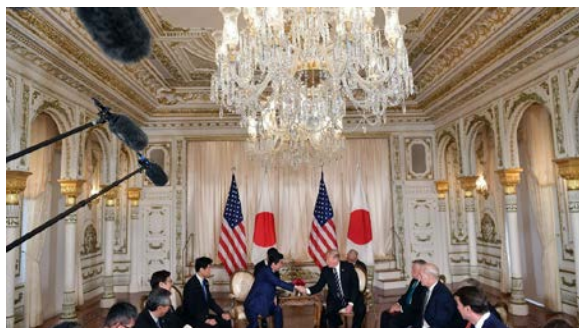
2 Trump and Abe meet at Mar-a-Lago

“Just because North Korea is responding to dialogue, there should be no reward. Maximum pressure should be maintained, and actual implementation of concrete actions towards denuclearization will be demanded. This firm policy has once again been completely shared between us.”