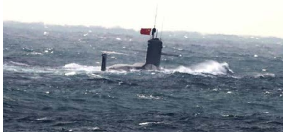
2Chinese submarine in Japanese contiguous zone; January 11, 2018

“we’ll demand that the Chinese side not impede the current momentum for improving Japan-China relations.” China’s Foreign Ministry immediately defended the action, saying the waters are part of China’s inherent territory, leaving no doubt as to the submarine’s nationality. After crews of two Japanese destroyers approached the submarine, it raised the Chinese national flag. They photographed the vessel and stopped pursuit when it headed toward China. With positive identification in hand, Vice Foreign Minister Sugiyama Shinsuke telephoned Chinese Ambassador Cheng Yonghua to lodge a fresh protest, saying that the entry by a submarine into a contiguous zone constituted “a unilateral change of status quo and a serious escalation” of the already tense situation in the area. Global Times editorialized that, although the incident could have been addressed through diplomatic means, Japan “hyped it up instantly, derailing its recent efforts to improve ties with China.” It urged the Tokyo government to cease blustering and show more composure. Jiefang Junbao , official newspaper of the People’s Liberation Army, added that, “the Chinese military will continue to firmly defend China’s territorial sovereignty and security interests by all means necessary.”