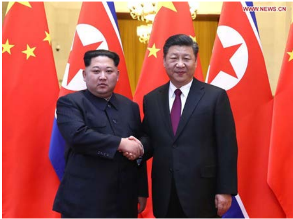
1 Kim Jong Un and Xi Jinping meet in Beijing

Kim Jong Un visited China on March 25–28 for his first summit with President Xi on March 26. He was accompanied by his wife Ri Sol-ju and other officials, including Choe Ryong-hae. On his first foreign trip since taking office in 2011, Kim affirmed his commitment to denuclearization and willingness to hold summits with South Korean and US leaders. The four-day visit marked the start of Pyongyang's reconciliation with Beijing after almost a decade of frictions over its nuclear and missile development, and efforts to build bargaining leverage ahead of Kim's anticipated talks with Presidents Moon and Trump.