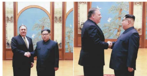
2US Secretary of State Mike Pompeo and North Korean leader Kim Jong Un shake hands in Pyongyang

By President Moon’s own admission, the Kim-Moon summit, symbolically important as it was in its own right, was also the scene-setter for the unprecedented meeting between a sitting US president and North Korea’s leader. A more conventional US president would have insisted on some deliverables in advance of a summit, which critics claim bestows undeserved credibility and prestige on Kim Jong Un. If we have learned nothing else in the past year, it is that President Trump is not your conventional US leader. The only thing that appears to be rising higher than expectations about the summit meeting are anxieties that it could fail and result in disaster. This disaster could take the form of Trump walking out in anger, leaving few options on the table short of even more extreme pressure and/or some type of military action. Or it could take the form of Trump being tricked into what seems like a good deal by the North Korean leader, whose real goal is not denuclearization but a lifting of sanctions and the gaining of international credibility and status as a member of the nuclear weapons club.