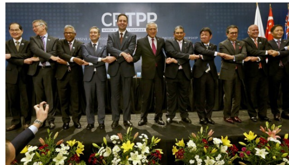
3 Trade Ministers from the TPP-11

As the storm gathered, Japan remained within the president's crosshairs, despite repeated attempts to explain why it deserved an exemption. Prior to his April meeting with Prime Minister Abe, Trump suggested that the US might rejoin the TPP, from which he withdrew during the first week of his presidency, but that tease was subsequently crushed .