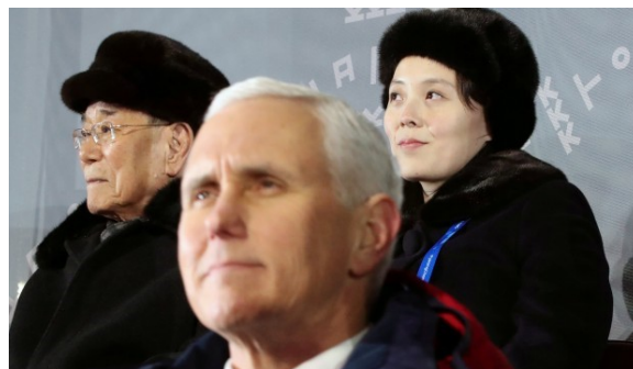
1US Vice President Mike Pence refuses to acknowledge North Korean delegation at PyeongChang Olympics

By late January, many analysts in Korea and the United States felt a US strike – limited, targeted or massive – was a likely course of action. Concerns seemed to amplify as the White House confusingly passed over prominent scholar Victor Cha as US ambassador to South Korea. Cha’s appointment had been approved by Seoul, when the National Security Council reportedly pulled the nomination. Cha regarded the bloody nose approach unnecessarily risky, which reportedly was the reason for the break. Personnel issues signaled further discord with the retirement of Joseph Yun, the US lead on North Korea, after Trump’s resistance to talks without preconditions. Later in the period, the replacement of Rex Tillerson and H.R. McMaster with Mike Pompeo and John Bolton as secretary of State and national security advisor, respectively, worried Seoul. It saw a swap of such senior leadership shortly before a US summit with the DPRK as disorganized and flagging a harder line out of sync with the progressive Moon camp.