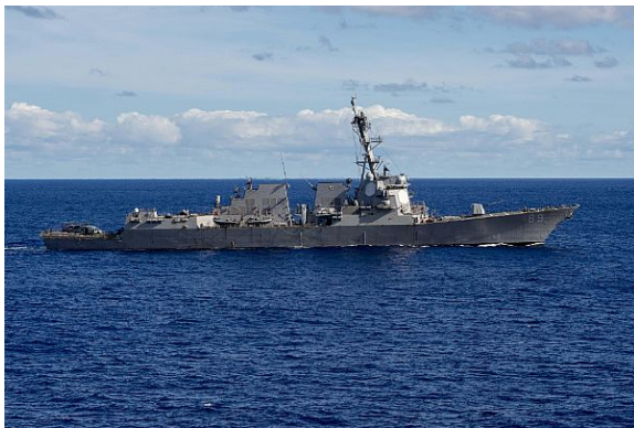
2USS Mustin

The second US FONOP was carried out on March 23 by USS Mustin , a guided-missile destroyer, within 12 nm of Mischief Reef. Since Mischief Reef was found by an arbitral tribunal in July 2016 to be a low-tide elevation on the Philippines' continental shelf, the US Navy ship was within its legal rights to go beyond an "innocent passage," conducting maneuvers while sailing close to the reef. This was the third time the US has conducted a FONOP around Mischief Reef. The first took place May 24, 2017, marking the first FONOP by the Trump administration in the South China Sea, and the second took place Aug. 10, 2017. Mischief Reef is one of the three large military outposts that China has built in the Spratly Island chain. The other two are Fiery Cross and Subi Reefs.