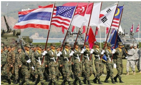
1 Cobra Gold Exercises 2018 - member flags

The diplomatic season in Southeast Asia tends to downshift into a lower gear in the early months of the year as the chair of the Association of Southeast Asian Nations (ASEAN) rotates to a new member state, with Singapore assuming that role in 2018. The first of the two annual ASEAN Summits, usually in April, is an internal one, while the second involves ASEAN's external partners and culminates in the East Asia Summit. By contrast, Southeast Asian relations in support of defense relations are more evenly distributed over the year and are jump-started in February with the conduct of the annual Cobra Gold exercises in Thailand. Cobra Gold is co-chaired by the United States and Thailand and, in the 2018 event, included a total of 29 nations.