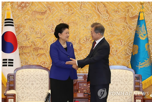
2 South Korean President Moon Jae-in (R) shakes hands with Chinese Vice Premier Liu Yandong before the start of their meeting at the South Korean presidential office Cheong Wa Dae in Seoul on Feb. 26, 2018.

first North-South dialogue in more than two years produced an agreement allowing their athletes to march under a unified flag at the opening ceremony. As head of China's delegation, CPC Politburo Standing Committee member Han Zheng, met South and North Korean officials on the sidelines of Olympic opening ceremonies including President Moon and DPRK parliamentary chief Kim Yong Nam. In talks with Han Zheng on Feb. 8, Moon called for Chinese support for building momentum toward inter-Korean and US-DPRK dialogue. Kim Jong Un's sister Kim Yo Jong delivered the North Korean leader's summit invitation to Moon and the DPRK delegation affirmed Pyongyang's willingness to hold talks with the Trump administration. Seoul similarly hosted high-level Chinese and North Korean delegations for the Olympics closing ceremony on Feb. 25, led by PRC Vice Premier Liu Yandong and DPRK national intelligence chief and WPK Vice Chairman for ROK Affairs Kim Yong Chol. Moon backed China's longstanding position on US-DPRK bilateral talks as a prerequisite for international nuclear negotiations on Korea, a central message exchanged between Chinese and South Korean officials at the conclusion of the Games.