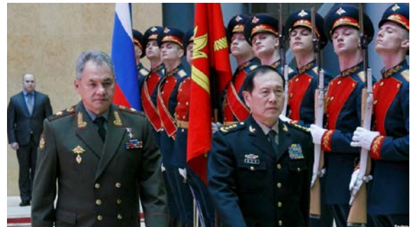
2 Defense Minister Sergey Shoigu and Defense Minister Wei Fenghe

Other high-ranking Chinese officials were also in Moscow in early April. China's newly appointed Defense Minister Wei Fenghe (魏凤和) visited April 1-5 on his first overseas trip after his mid-March appointment. In addition to getting acquainted with his Russian counterparts, Wei attended the Seventh International Security Conference on April 4-5, which, according to Wei, was a signal to "let the Americans know about the close ties between the armed forces of China and Russia." In his meeting with Wei, Russian Defense Minister Sergey Shoigu was quoted as saying that the high-level Russian-China relationship was becoming an important factor for world security.