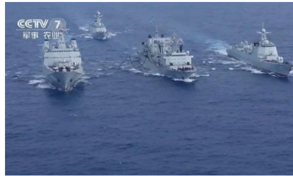
1Chinese media footage showing the naval task force currently operating in the eastern Indian Ocean; including an amphibious assault ship, a guided missile destroyer and frigate, and a supply ship

Vietnam-China Relations. Vietnam took steps in 2018 to improve its regional position in the face of China’s power. In addition to welcoming the US aircraft carrier Carl Vinson to Vietnam despite Chinese objections, Vietnam’s president in March visited India and endorsed the concept of the Indo-Pacific. That month Vietnam for the first time joined India in participating in the Milan military exercises in the Indian Ocean. This development coincided with the China-India dispute over contested leadership in the Maldives Islands, and prompted criticism of Vietnam in some Chinese media. Vietnam’s prime minister also advanced strategic relations with both Australia and New Zealand, strengthening Vietnam’s relations with governments at odds with China’s ambitions in the South China Sea. Nevertheless, Hanoi remained on good terms with China. The annual meeting of the Vietnam-China Steering Committee for Cooperation, held in Hanoi in early April, saw State Counselor and Foreign Minister Wang Yi reach numerous agreements with his Vietnamese counterpart, with both sides promising to keep the peace in the South China Sea and to address disputes peacefully. Facing apparent Chinese pressure, Vietnam again decided to cancel oil drilling activity of a Spanish energy firm in disputed waters for the second time in a year.