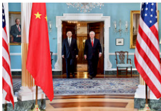
1Secretary of State Rex Tillerson with Chinese State Councilor Yang Jiechi

economic and trade issues by opening each other’s market and making a big cake of cooperation, so as to safeguard sound management of bilateral economic and trade relations.” The statement claimed that the US and China had agreed to hold the second round of the China-US Comprehensive Economic Dialogue before the end of the year, but it later became apparent that the Trump administration had not reached such an agreement.