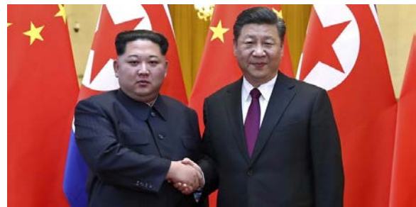
1 North Korean leader Kim Jong Un and Chinese President Xi Jinping shake hands in Beijing, China

President Xi had previously refused to meet with Kim, reportedly out of frustration and annoyance with the North Korean leader's actions, which "disrespected" Beijing. Suddenly, it appeared as if Xi was playing catch-up to avoid being marginalized in the emerging peace offensive. Japanese Prime Minister Abe Shinzo quickly began signaling his own willingness (eagerness?) to meet Kim; can Putin be far behind? Abe also rushed to Washington seeking reassurance from Trump that their previously closely synchronized hardline approach toward Pyongyang would not be undermined. He also hoped, to no avail, that his bromance with Trump would get Japan excused from impending steel tariffs. More on this later.