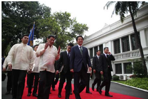
1Abe and Duterte 2017

The policy adjustments that Japan and Southeast Asian states have made derive from the power shift caused by China's increasing influence in East Asia and the world, but this trend accelerated with the emergence of Trump and Duterte. In East Asia, the adjustments are well illustrated by the August 2017 release of the Revised Implementation Plan of the Vision Statement on ASEAN-Japan Friendship and Cooperation: Shared Vision, Shared Identity, Shared Future . The document is the revision of the implementation plan of the 2013 ASEAN-Japan Vision Statement, which emphasized the importance of enhancing social, economic, political, and security ties between Japan and ASEAN, as well as between Japan and each Southeast Asian state. Furthering their comprehensive ties, three agendas became the center for their strategic focus in 2017/2018: trade, security, and development.