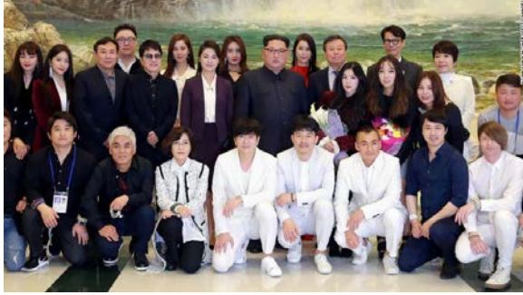
3Kim Jong Un poses for a photo with South Korean performers