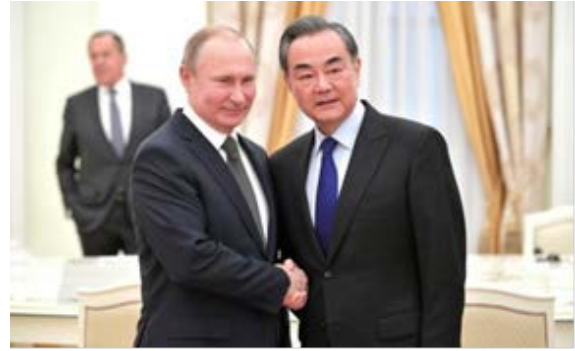
1 President Putin with Special Envoy of the Chinese President, Member of the Chinese State Council, and Foreign Minister Wang Yi

In his meeting with President Putin, Wang Yi also framed China's relations with Russia as based on "the highest level of political mutual trust" (最高水平的政治互信) with the CSPC as the only status that each country granted to the other (中俄互为彼此唯一的全面战略协作伙伴). Wang's Moscow trip was particularly weighted as he was defined as a special envoy of President Xi, who received his second term as Chinese president five days after Putin got his fourth-term presidency. Russia was also Wang's first foreign destination after his appointment as a counselor of the State Council (国务委员), which is equivalent to being a vice premier. This means Wang will supervise China's foreign affairs even after he retires from the foreign minister position.