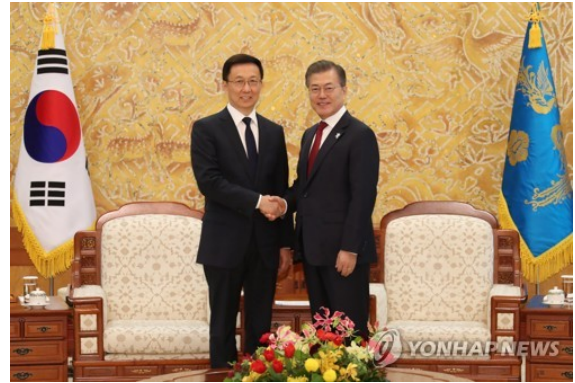
3 South Korean President Moon Jae-in (R) shakes hands with Han Zheng, a member of the Politburo Standing Committee of the Communist Party of China, before their meeting at his office Cheong Wa Dae in Seoul on Feb. 8, 2018.

President Moon's Olympic diplomacy catalyzed Seoul's bilateral coordination with six-party members in March, led by National Security Advisor Chung Eui-yong and intelligence chief Suh Hoon. Chung and Suh led a South Korean delegation to Pyongyang as special envoys of President Moon, where they were hosted for a dinner meeting and had an extended conversation with Kim Jong Un on March 5. Upon their arrival back in Seoul the following day, Chung and Suh announced plans for an April inter-Korean summit at Panmunjom and were dispatched to Washington for a meeting with President Trump on March 8, at which they announced that Trump had accepted an invitation for a US-DPRK summit. Chung's talks with President Xi and Russian officials in Beijing and Moscow on March 12-13, and a simultaneous meeting between Suh and Prime Minister Abe Shinzo in Tokyo, aimed to build regional support for the summits. Seoul's high-level diplomacy from January also aided the resumption of trilateral dialogue with China and Japan. After Moon's meeting with Japanese Foreign Minister Kono Taro in Seoul on April 11, the presidential office announced plans for a trilateral summit in Japan in May. PRC Premier Li Keqiang and Kono on Jan. 28 pledged to resume the trilateral summit this year after three years of deadlock over China-Japan maritime disputes.