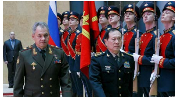
2Defense Minister Sergey Shoigu and Defense Minister Wei Fenghe

Other high-ranking Chinese officials were also in Moscow in early April. China's newly appointed Defense Minister Wei Fenghe (魏凤和) visited April 1-5 on his first overseas trip after his mid-March appointment. In addition to getting acquainted with his Russian counterparts, Wei attended the Seventh International Security Conference on April 4-5, which, according to Wei, was a signal to "let the Americans know about the close ties between the armed forces of China and Russia." In his meeting with Wei, Russian Defense Minister Sergey Shoigu was quoted as saying that the high-level Russian-China relationship was becoming an important factor for world security.