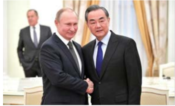
1President Putin with Special Envoy of the Chinese President, Member of the Chinese State Council, and Foreign Minister Wang Yi

In his meeting with President Putin, Wang Yi also framed China's relations with Russia as based on "the highest level of political mutual trust" (最高水平的政治互信) with the CSPC as the only status that each country granted to the other (中俄互为彼此唯一的全面战略协作伙伴). Wang's Moscow trip was particularly weighted as he was defined as a special envoy of President Xi, who received his second term as Chinese president five days after Putin got his fourth-term presidency. Russia was also Wang's first foreign destination after his appointment as a counselor of the State Council (国务委员), which is equivalent to being a vice premier. This means Wang will supervise China's foreign affairs even after he retires from the foreign minister position.