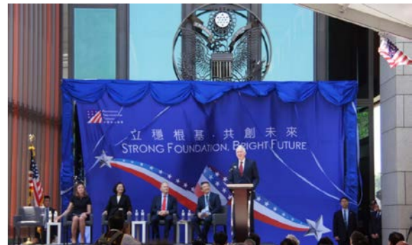
Figure 2 Remarks by Chairman James Moriarty at the Dedication Ceremony of AIT's New Office Complex.

strong U.S. commitment to Taiwan, the close and cooperative ties between our people, and the enduring friendship between the United States and Taiwan."