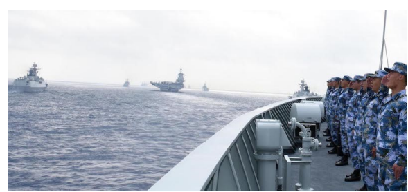
Figure 2 A PLA Navy fleet in the South China Sea in April 2018.

The China-US acrimony in Singapore caused host Prime Minister Lee Hsien Loong to <u>warn</u> at the end of the meetings that while it's desirable for ASEAN states not to take sides in the rivalry between the two powers, "circumstances may come when ASEAN may have to choose one or the other. I am hoping that it's not coming soon."