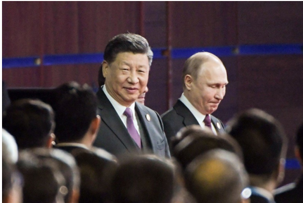
Figure 1 Chinese President Xi Jinping (left) and Russian President Vladimir Putin arrive for the opening ceremony of the Belt and Road Forum in Beijing.

of the BRF crowd, Putin was prominently featured and treated with respect.