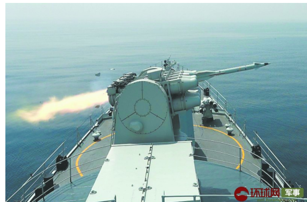
Figure 4 Harbin fired its ship-to-air short-range missile.

Joint air defense was the last item of the exercises. On May 4, the PLAN Harbin (guided missile destroyer) and the Russian Admiral Vinogradov (anti-submarine warfare ship) each fired a short-range ship-to-air missiles and destroyed incoming “enemy” missiles (simulated by drones). This “first-ever” joint air defense was said not only to require close coordination of the two navies, but also the sharing of weapons’ technical and tactical data (性能参数).