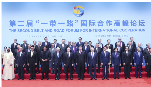
Figure 2 Chinese President Xi Jinping takes a group photo with foreign leaders and heads of international organizations.

China's Belt and Road Initiative (BRI) – initiated by President Xi Jinping in 2013 – borrows the historical symbol embodied in the ancient Silk Road and incorporates new connotations of the times for the construction of an international platform for promoting trade, connectivity, and social exchanges. According to China's statistics, as of April 20, 2019, China has inked 174 cooperative documents with 126 countries and 29 international organizations. From 2013 to 2018, the total trade volume of goods between China and the countries along the BRI routes has exceeded $6 trillion. Of the 1,400 BRI investment items above $1 million in the past five years, only 100 are somewhat "problematic," according to a Boston University survey .