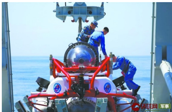
Figure 3 Two Russian submarine sailors are coming out of China’s deep-sea rescue underwater vehicle to be transferred to the Chinese deep-sea rescue ship Ocean Island (海洋岛号援潜救生船).

Joint Sea 2019 started with land/beach drills by the marines of the two navies on April 30. On May 2, sea drills began with the two navies practicing submarine rescue missions of each other’s “damaged” subs. This was a significant elevation of interoperability of the two navies. In Joint Sea 2017 , the Chinese deep-sea rescue underwater vehicle only “coupled” with a Russian submarine. This time, crew members were rescued and transported by each other’s rescue teams . “This is a major step toward step beyond the 2017 operation,” remarked Du Changyu, commander of the Chinese deep-sea rescue operation. “It requires very high mutual trust between the two militaries for such a high-risk operation requiring high degree of coordination,” he added. This meant the Chinese and Russian submarine crews would put their lives and combat potential in the hands of each other’s rescue team, commented Global Times .