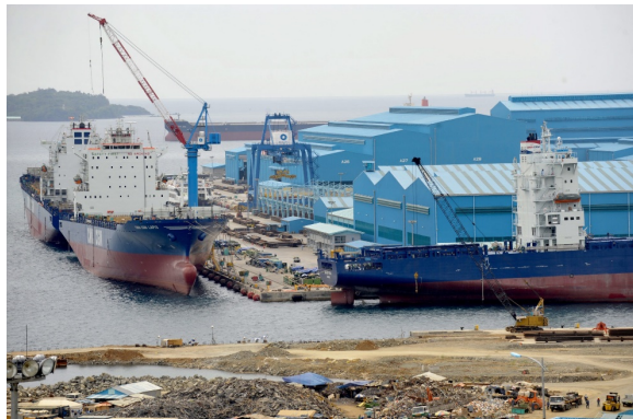
Figure 1 View of the Subic Bay shipyard.

maritime militia have been involved in a standoff near Thitu Island, with the presumed intent of intimidating the Philippine occupiers and halting construction activity. According to the CSIS Asia Maritime Transparency Initiative, in early March, the presence of suspected maritime militia boats spread to two smaller nearby Philippines-held features. The issue prompted thousands of Philippine citizens to protest the Chinese “invasion,” and shifted opinion against China in the lead-up to important nationwide legislative elections in May. In response, Duterte warned China to stop the pressure or he would order his soldiers to defend the territory. His chief aides were more vocal in criticizing China’s “assault.” The issue did not disrupt Foreign Secretary Teodoro Locsin’s inaugural visit to China in March, which went smoothly according to official Chinese media. The foreign secretary’s visit was in preparation for Duterte’s attendance at the BRI Forum in Beijing in April. Philippine officials hailed Duterte’s “highly successful” visit in late April, featuring numerous economic agreements and private talks with Xi Jinping on the dispute over Thitu Island.