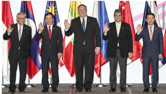
Figure 2 Secretary Pompeo poses with the Foreign Ministers of Thailand, Vietnam, Malaysia and Laos during the US-ASEAN Ministerial Meeting on the sidelines of the ASEAN Foreign Ministers Meeting.

partnership of respect towards the sovereignty of each of our nations, and a shared commitment to the fundamental rules of law, human rights, and sustainable economic growth.” But he further stressed that “we don’t ever ask any Indo-Pacific nation to choose between countries. Our engagement in this region has not been and will not be a zero-sum exercise. Our interests simply naturally converge with yours to our mutual benefit.”