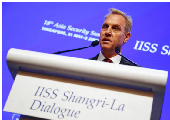
Figure 1 Acting US Defense Secretary Patrick Shanahan speaks at the Shangri-La Dialogue.

It was no accident that the Indo-Pacific Strategy Report was released the day prior to Acting Secretary Shanahan’s debut at this year’s Shangri-La annual gathering. In his prepared remarks , he made all the above points, while also stressing the administration’s commitment to enduring principles of international cooperation: respect for sovereignty and independence of all nations, large and small; peaceful resolution of disputes; free, fair, and reciprocal trade and investment, which includes protections for intellectual property; and adherence to international rules and norms, including freedom of navigation and overflight – further noting that “these are not American principles; they are broadly accepted across this region and the world.”