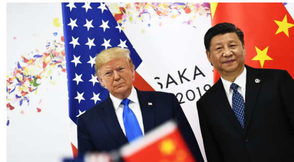
Figure 3 President Trump and President Xi at the G20 Summit in Osaka on June 29, 2019.

As always, much of the substantive work at the G20 occurred during bilateral meetings on the sidelines. The most important of those (for our purposes) was the dinner between US President Donald Trump and Chinese Chairman Xi Jinping, at which they declared a truce in their escalating trade war. Trump agreed to halt the imposition of additional tariffs, and the two sides agreed to continue negotiations on a final deal. Trump also said that China had agreed to purchase more agricultural products, a point disputed by the Chinese. (For more, see the chapter on US-China relations in Comparative Connections.)