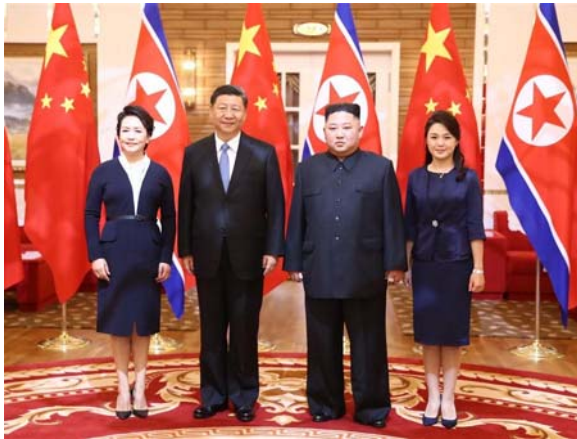
Figure 1 Xi Jinping meets Kim Jong Un in North Korea.

Xi Jinping sought to open a “new chapter” in China-DPRK relations after 70 years of diplomatic ties, as indicated in his front-page op-ed in North Korea’s party paper Rodong Sinmum on the eve of his visit. While the two leaders last met in Beijing this January, Xi’s visit on June 20-21 was the first visit to North Korea by China’s top leader since Hu Jintao made the trip in 2005, and the fifth such visit since the establishment of diplomatic relations in 1949. Xi was accompanied by Director of the Chinese Communist Party (CCP) General Office Ding Xuexiang, Director of the CCP Office of the Foreign Affairs Commission Yang Jiechi, Foreign Minister Wang Yi, National Development and Reform Commission Minister He Lifeng, and Xi’s wife, Peng Liyuan. He received a grand welcome from Kim Jong Un upon arrival at Pyongyang International Airport, and a special salutation at the Kumsusan Palace of the Sun or Kim Il Sung Mausoleum, a monument no other Chinese leader has visited. Accompanied by first ladies Peng Liyuan and Ri Sol Ju, Xi and Kim watched North Korea’s signature Mass Games performance and paid respects to the Chinese People’s Volunteer Army at the Friendship Tower in Pyongyang. Themed on the bilateral friendship, the Mass Games show involved more than 50,000 participants and featured Chinese cultural performances including songs hand-picked by Kim Jong Un.