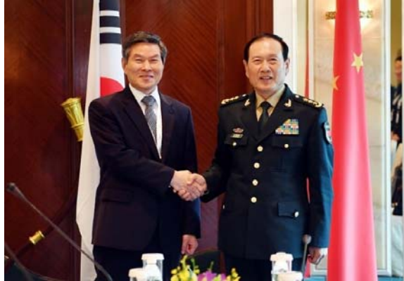
Figure 3 Jeong Kyeong-doo meets General Wei Fenghe on the sidelines of the Shangri-La Dialogue in Singapore.

to develop clearer understandings on disaster relief and humanitarian assistance cooperation. These confidence-building measures are intended to reduce miscommunication or miscalculation and represent the first steps toward recovery of military relations following the THAAD dispute in 2016.