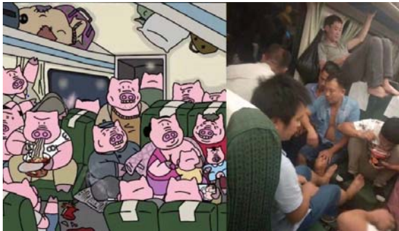
Figure 3 Chinese cartoons depict Chinese as pigs.

Xinhua reported on a July 7 rally in Japan's Saitama Prefecture to mark the 82 nd anniversary of the Marco Polo Bridge incident that was a prelude to the China-Japan war. It noted that only one member of the group, now 97 years old, actually lived through the war, and cited a Japanese member of the Sino-Japanese Friendship Association as saying that only about 20% of Japanese people knew the truth about Japan's war of aggression against China. In a separate report on the Chinese commemorative ceremony published the following day, Xinhua did not mention the presence of top leaders, leading to speculation that their absence indicated a desire for continued improvement in relations between the two nations. However, a few days later, at least 10 Chinese in two different provinces were arrested for being "spiritually Japanese" as a result of cartoons deemed to have insulted the Chinese people. In an editorial on Chinese fake news efforts in Hong Kong, the normally China-friendly Japan Times commented that although Japan has been largely immune to attempts to manipulate its public opinion, that was sure to change.