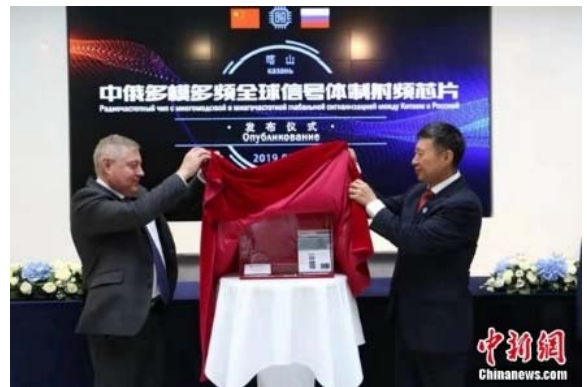
Figure 2 Unveiling the multimode multi-frequency for global signaling” chip in Kazan, Russia, August 31, 2019.

Other areas of high tech were moving ahead as well, including the integration of China’s Beidou (北斗) satellite system with Russia’s GIONASS (ГЛОНАСС), cooperation in remote sensing, heavy rocket engines, and joint moon exploration. The two sides started cooperation in space-related areas some years ago. In St. Petersburg, Dmitry Rogozin , director of the Roscosmos State Corporation for Space Activities (Роскосмос), revealed that Russia was negotiating with China more joint efforts in the future. At the sixth Session of the China-Russian Committee of Strategic Cooperation for Satellite Navigation held in Kazan, Russia, the two sides indicated that they were poised to implement the cooperation accord between China’s Beidou and Russia’s GIONASS satellite guiding systems. The two sides went as far as to unveil a joint “multimode multi-frequency for global signaling” chip (全球信号多模多频射频芯片) to connect their satellite systems.