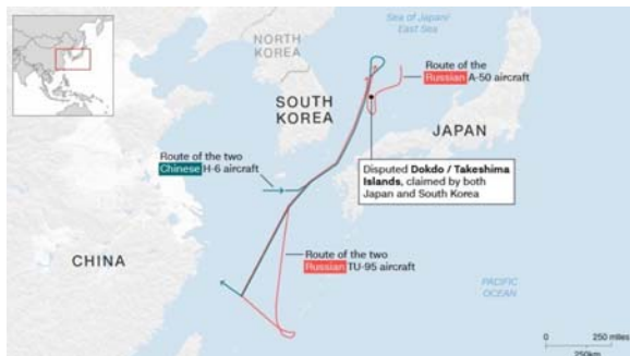
Figure 4 Flightpath of Chinese and Russian planes over the Sea of Japan, the East China Sea, and the Tsushima Strait.

The two naval "breakthroughs" were matched on July 23 with the first long-range joint air patrol by the Chinese and Russian air forces. Two Russian Tu-95 strategic bombers and two Chinese H-6 bombers, accompanied by early warning planes (a Russian A-50 and a Chinese KJ-2000 ), conducted a predetermined flight route over the Sea of Japan, the East China Sea and the Tsushima Strait between South Korea and Japan (see flight map below).