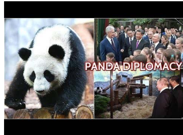
Figure 3 Vladimir Putin and Xi Jinping at the Moscow Zoo.

For this new start, Xi and Putin went to the Moscow Zoo to inaugurate the Panda Pavilion , where giant pandas (Ru Yi and Ding Ding) just started their 15-year residency, which is a symbol of good will from China and also part of an international program to preserve, protect, and research these animals. The last time Muscovites saw pandas was in 1957.