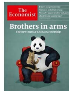
Figure 5 The Economist's cover depicts an asymmetrical relationship between China and Russia.

Russia's concerns were noticed by Washington, which has tried to weaken the emerging " Beijing-Moscow axis " as much as possible. Western media, too, was eager to highlight the increasingly asymmetrical relationship between Beijing and Moscow in terms of power. The lead article of the Economist , for example, was titled " The Junior Partner : How Vladimir Putin's embrace of China weakens Russia." Its cover featured a gigantic giant panda (China) holding a teddy bear (Russia) on his lap.