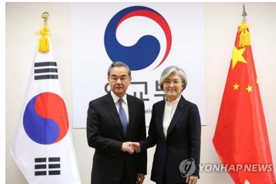
Figure 2 Foreign Ministers Wang and Kang meet in Seoul.

disappointment. Wang met his ROK counterpart Kang Kyung-wha for the second time after meeting on the sidelines of the UN General Assembly in New York on Sept. 25. He also met Moon, leader of the ruling Democratic Party and former Prime Minister Lee Hae-chan, and former UN Secretary-General Ban Ki-moon. In addition to reaffirming their commitment to denuclearization and peace, Wang and ROK counterparts agreed to coordinate Xi's Belt and Road Initiative and Seoul's development strategies, and advance trade via the China–ROK FTA, the Regional Comprehensive Economic Partnership (RCEP), and proposed trilateral FTA with Japan. For Lu Chao of Liaoning Academy of Social Sciences, Wang's visit signaled a mutual willingness to restore ties amid strain in Beijing and Seoul's respective relations with Washington and Tokyo.