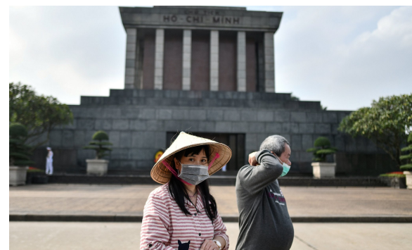
Figure 2 Tourist arrivals in Vietnam fell by double-digits relative to February last year.

There is a widespread belief that the pandemic will permanently change the way business is conducted. With nearly 100 governments closing national borders, flows of people, for business and pleasure, have been stopped. Tourism is an immediate casualty of this decision and many small and emerging economies that rely on foreign visitors are being badly hurt. The UN Department of Social and Economic Affairs (DESA) noted that 11 of the 25 countries in which tourism contributes the most to the economy are in the Asia Pacific region; tourist arrivals in Sri Lanka and Vietnam fell by double-digits relative to February last year. It also noted that small- and medium-sized enterprises account for 80% of the global tourism sector which employs approximately 123 million people worldwide, and they will sustain outside damage.