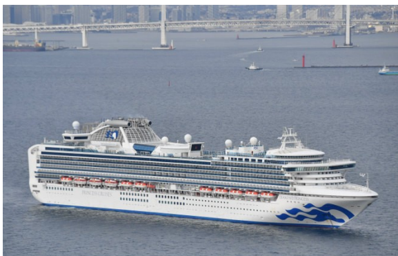
Figure 1 The Diamond Princess off Yokohama Port on February 4, 2020.

Infectious disease experts at the Ministry of Labor, Health, and Welfare, who argued for tracing the contacts of those who tested positive, guided Japan's initial response. This cluster approach was embraced by the panel of experts later convened by the prime minister on February 17, led by Wakita Takaji, chief of the National Institute of Infectious Diseases. One early cluster, identified in Hokkaido, prompted the local governor to order a shutdown on February 28, but for the most part the country went about its business as usual. But testing was limited to only those with direct contact with China or others who had tested positive for COVID-19, which beyond the Diamond Princess cases was a small number even as late as the end of February.