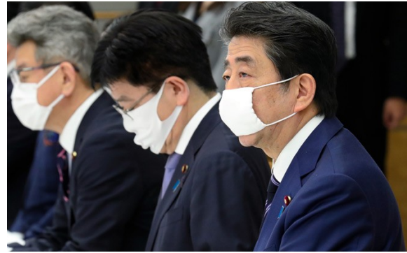
Figure 5 Prime Minister Shinzo Abe announces his plan to distribute cloth face masks to Japanese households at an April government task force meeting.

Abe, too, has watched his approval numbers drop as even his supporters watched his handling of the virus. Both have been criticized for their delayed response. The editorial board of the Yomiuri Shimbun was quite blunt: "Even though there is a lot that we don't yet know about this new coronavirus, the Abe Cabinet's response to date has been far from strategic." Japanese social media targeted Abe's announcement that the government would send two masks to every family, a policy that was cynically dubbed as " Abenomask ," and his video of being at home in self-isolation.