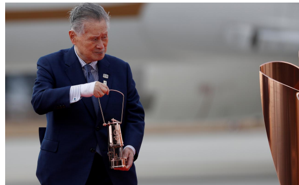
Figure 3 Tokyo 2020 Olympics President Yoshiro Mori holds the Olympic Flame at a ceremony in Higashi-Matsushima, Miyagi prefecture in March.

While the government initially held out hope that the games could go ahead as planned, after Canada and Australia announced that they would skip the games in mid-March due to concerns for the health of their athletes, Japan and the International Olympic Committee (IOC) announced on March 24 that they would postpone the games to July 23-August 8, 2021. Early estimates of how much the yearlong delay will cost Japan range from $2 billion to $6 billion . Officially, the Japanese government has said that it is spending $12 billion on the games, but government auditors said back in December that it would likely cost twice as much. As new expenses and logistical challenges accumulate, at issue too is to what extent the Japanese government will have to shoulder the costs of delay compared to the IOC. Moreover, while Japanese officials have referred to the rescheduled Tokyo Olympics as a potential " beacon of hope " for the world, there is also a lingering worry that the games might have to be cancelled altogether, a prospect some analysts suggest would cost Japan more than $42 billion.