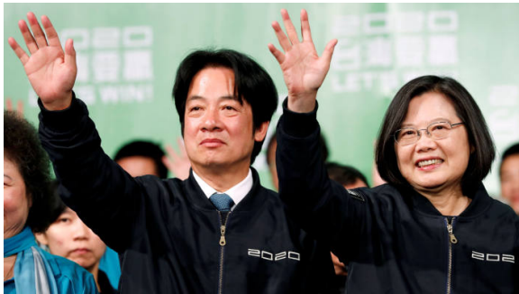
Figure 1 President Tsai Ing-wen and vice-president-elect Lai Ching-te wave to supporters on the night of their election victory.

Tsai scored a stunning victory in the January 11 election, winning 57% of the vote and becoming the first presidential candidate to win over 8 million votes.