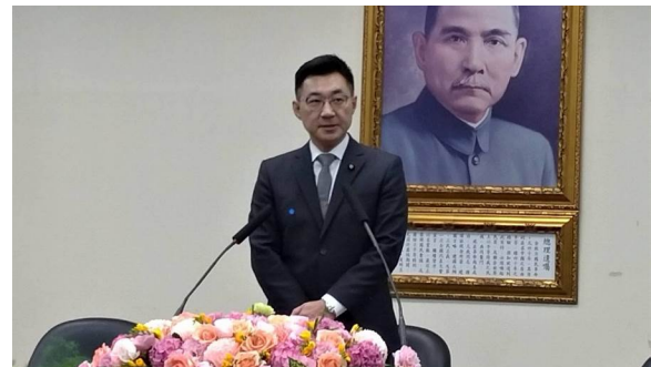
Figure 3 Chiang Chi-chen’s swearing in as the new KMT chairman.

The KMT went ahead with its by-election despite the COVID-19 risks. Chiang Chi-chen won with 69% of the vote.