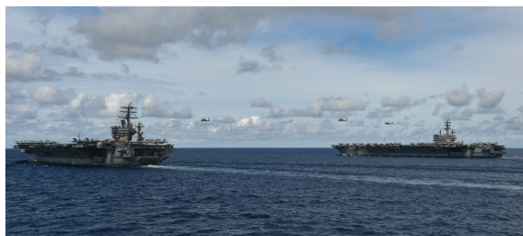
Figure 2 USS Nimitz and Reagan in the July 17 operation in the South China Sea.

and supporting warships in their respective strike groups. The Roosevelt and the Nimitz held joint exercises in the Philippines Sea on June 21. The Nimitz and the Reagan then combined to form a strike force for operations in the South China Sea on July 4-7; and they returned for another round of operations in the South China Sea on July 17. The exercises also were notable for involving long-range US B-52 and B-1 bombers. On July 20 the Nimitz was exercising with Indian forces in the Bay of Bengal at the mouth of the strategic Malacca Strait, and on July 21-23 the Reagan exercised in the Philippines Sea with Japanese forces and a large contingent of warships from Australia. Such unprecedented US military muscle-flexing was seen in Chinese commentary as providing the background for the Pompeo and Stilwell statements strongly supporting regional South China Sea claimants against China's illegal claims.