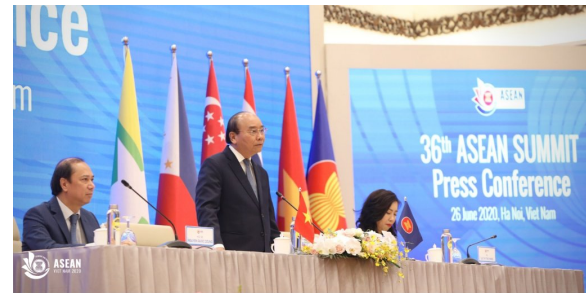
Figure 1 Vietnamese Prime Minister Nguyen Xuan Phuc, and Chairman of ASEAN for 2020 attend the 36th ASEAN Summit.

South China Sea and as usual they did not mention China or its actions there. But this year’s statement was seen to undercut Chinese territorial claims based on historical process by asserting that the 1982 UNCLOS is the basis for determining maritime rights and governing “all activities” in the oceans and seas.