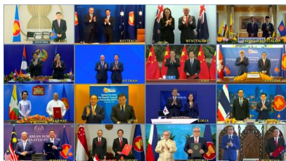
Figure 1 Leaders and trade ministers from the 15 Regional Comprehensive Economic Partnership countries pose for a virtual group photo during the signing ceremony hosted by Vietnam on November 15, 2020.

The big headlines came the following day when the other members of the EAS, minus India, Russia, and the US, announced the signing of the RCEP, which offers proof that ambitious plans can produce results. RCEP is the product of eight years of negotiation, and while less than intended—more on that in a minute—it is still the largest trade deal in history: its members account for 2.2 billion people and about 30% of the global economy.