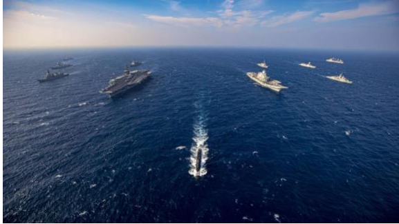
Figure 4 The Malabar naval exercises in November 2020.