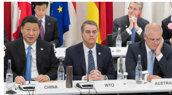
Figure 3 Chinese Chairman Xi Jinping and Australian Prime Minister Scott Morrison.

Despite some seemingly moderate Chinese rhetoric in October urging Australia to change course in its criticism of Chinese actions in Australia and abroad, Chinese restrictions on trade involving purchases of Australian wine, lobsters, copper, sugar, cotton, timber, and coal took effect in early November. What China was demanding to restore normal trade became clear in mid-November when Chinese officials met with Australian media and provided a list of 14 grievances that Australia needed to remedy. Widespread public outrage in Australia followed the Twitter post of a controversial Chinese foreign ministry spokesman, known for his aggressive, so-called " wolf-warrior " manner, showing the fabricated image of an Australian soldier with a knife to the throat of an Afghan child. Australian Prime Minister Scott Morrison denounced the "disgusting slur" and his government demanded an apology. Beijing was unapologetic, with official commentary in December advising that, from a Chinese perspective, the current Australian government is no longer trustworthy and Chinese people no longer see Australia as a friendly country, an attractive tourist destination, or a reliable destination for overseas studies. It forecast continued tensions.