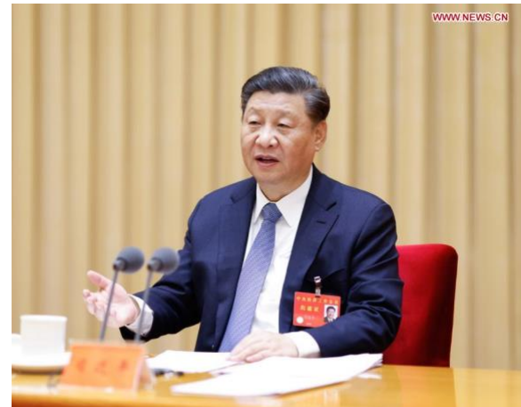
Figure 2 Chinese Chairman Xi Jinping speaks during the Central Economic Work Conference.

Building on the momentum of the RCEP agreement reached on Nov. 15, Chinese President Xi Jinping at the APEC leaders meeting on Nov. 20 capped his emphasis on multilateralism, an open world economy, and the leading role of the World Trade Organization with the announcement that China “will give favorable consideration to joining the Comprehensive and Progressive Agreement for Trans-Pacific Partnership (CPTTP).” That accord is a Japan-led effort to move forward with the high-standard Trans-Pacific Partnership (TPP) after US withdrawal from the TPP. During the Obama administration, the United States, Japan, and other TPP partners viewed the TPP as a means to get China to curb its widespread economic practices undermining free trade so it could join the TPP. Japanese Prime Minister Suga Yoshihide’s presentation at APEC on Nov. 20 said Japan was open to expanding CPTPP membership, leading ultimately to a much broader “Free Trade Area of the Asia Pacific,” long endorsed by APEC. Initial reaction to Xi’s interest in joining the CPTPP was mixed, with some prominent Japanese commentators warning of suspected Chinese efforts to use CPTPP membership to undermine its high standards and reinforce Beijing’s economic practices adverse to Japan and other CPTTP members.